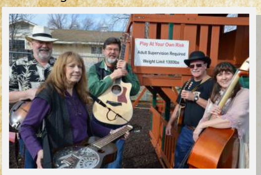
Sage Creek - 6pm