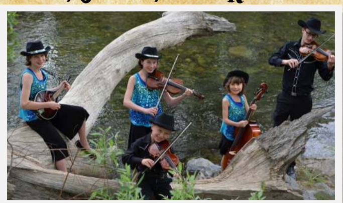
Sierra Silverstrings - Noon & 4pm