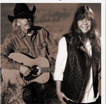
Vista - 1pm & 5pm