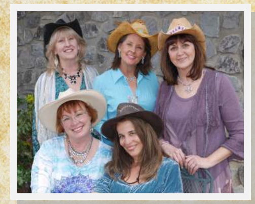
Sierra Sweethearts - 7pm