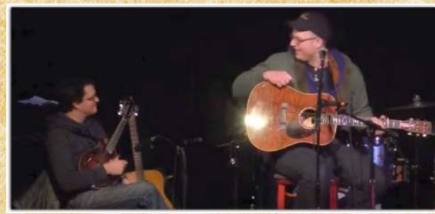
Bluegrass Lex N' Scotty - 2pm & 6pm