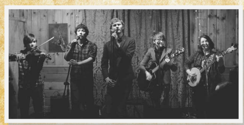
Horses of Thought - 7pm