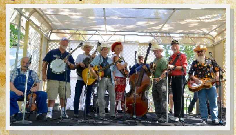
Northern Nevada Bluegrass Association Volunteer Orchestra—