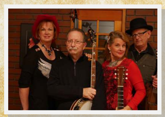
Suspect Terrane - 8pm

Roots Music at the Nevada State Fair is sponsored by The Traditional American Music Project www.sierratramp.org